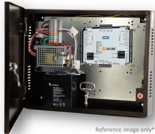
Reference image only*

IDCUBE's ICAERO-X300 is an Output Control Interface Panel which supports 12 general purpose outputs as Form C relay contacts and 5 general purpose input circuits (supervised or unsupervised). The output interface panel comprises of HID's output interface module AERO X300 along with optional accessories, i.e., UL certified power supply, charging circuit, battery, and tamper switch. The ICAERO-X300 connects to the ICAERO-X1100 (master controller panel) through a high-speed RS-485 network.